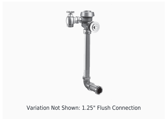
Variation Not Shown: 1.25" Flush Connection